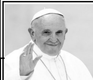
Pope Francis said:

Comienza la formación en la fe: El Programa de Formación de Fe comenzará el 11 de septiembre de 2022 con una reunión de padres e hijos. Padres, por favor hagan arreglos para asistir a la primera clase con sus hijos. Se dará información importante en este momento junto con el Calendario de Formación en la Fe. Si tiene alguna pregunta, llámeme durante el horario comercial habitual o envíeme un mensaje de texto a mi teléfono celular. Gracias a todos por ser parte del viaje de formación en la fe de su hijo.